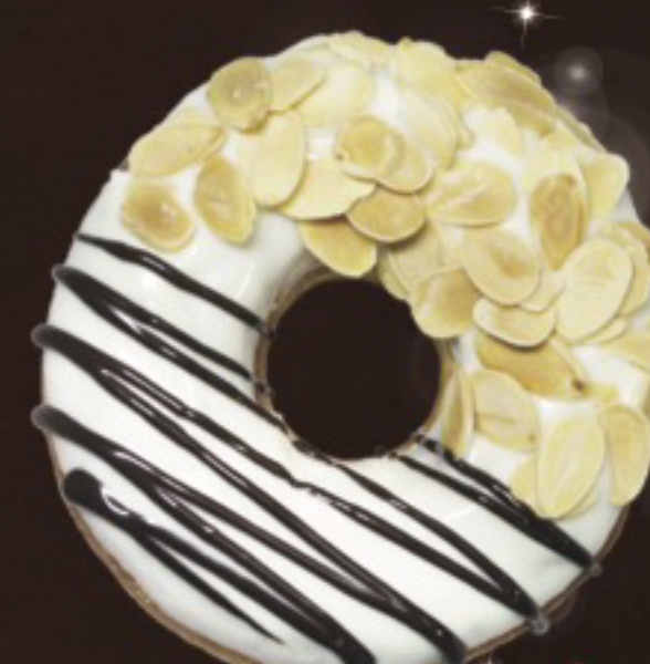
Vanilla Choc Almond