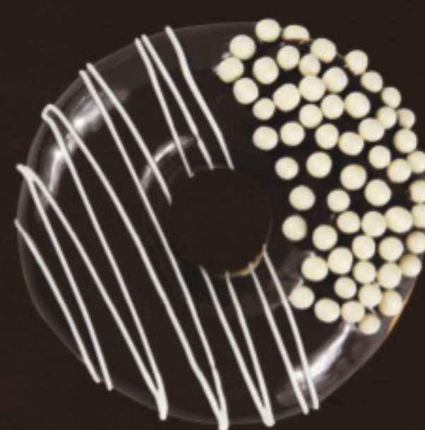
White Choc Fantasy